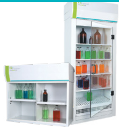
822 Shelf store