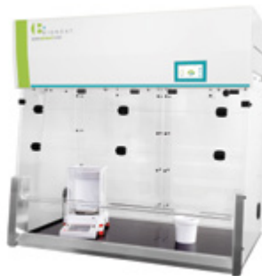
Excel Plus models including Safechange versions for precision applications