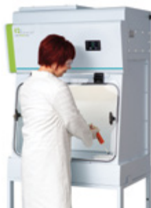
Operator & sample process protection