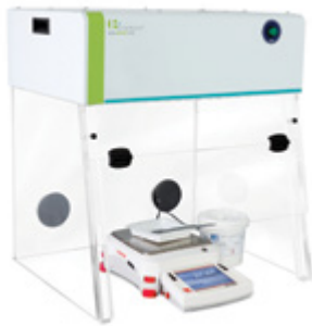
XIT & XIT Plus models Small footprint