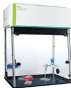
With or without HEPA filtration