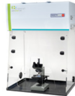
Asbestos Inspection Hood