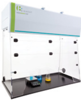
Chemcap Clearview & Chemcap Pro2