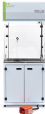
Chemical Dispensing Station