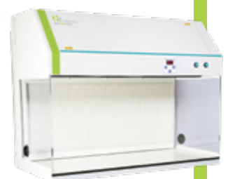
Vertical & Horizontal HEPA filtered air flow